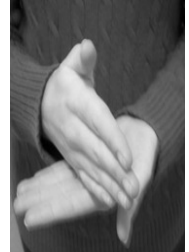
5 th grade stop signal paired with "enough"