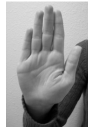
K-4 stop signal paired with "stop"